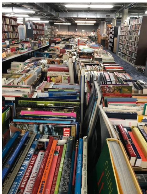
Before the Flood

What a year it's been! Following our most successful book sale ever, the catastrophic floods of August 2024 totally destroyed everything in the lower level of the library basement.